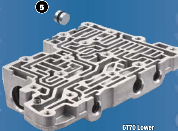
6T70 Lower Valve Body