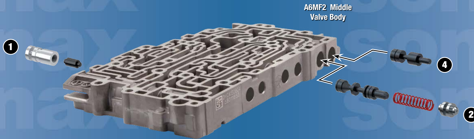
A6MF2 Middle Valve Body