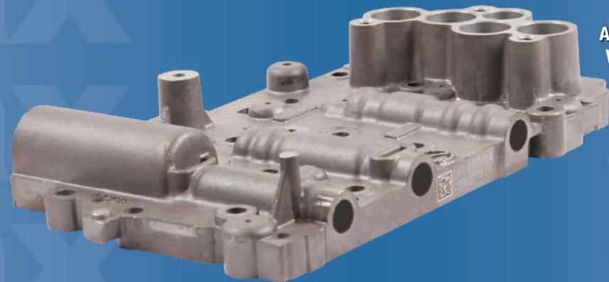
A6MF2 Inner Valve Body

Note: Requires tool kit F-102741-TL7 & the VB-FIX reaming fixture.