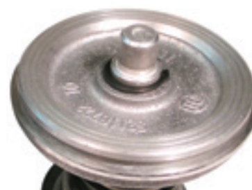
OEM version of 22912C 47-48RE, '97-Up