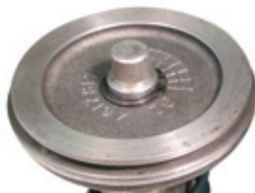
OEM version of 22912B 47RH/RE, '94-'96